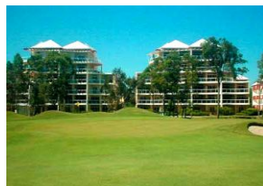
22,000 SF raft slab placed at 9' below water table to waterproof 6 story units