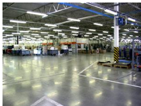
Industrial concrete floor performed excellent finishing without curing.