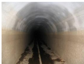
Mojave Aqueduct after 1 year of shotcrete application at 3/4" thick