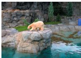
Polar Bear Shores in the cooled Marine pool of Sydney's ZOO