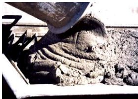
Creamy concrete flow / slump 2 1/2" pumpable up to 500.'